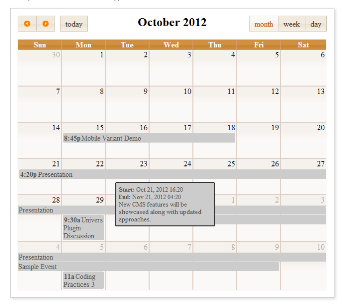
Multiple Calendar Views and Types